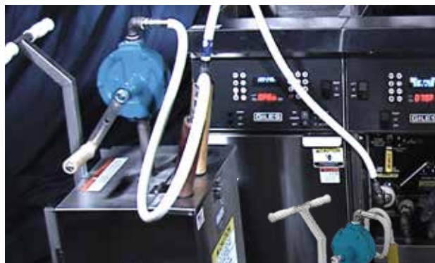
Portable and efficient unit with enough volume to hold waste oil from two (2) medium size fryers (approx. 80 lbs).

We offer the Fryer Pot Cleaner, Filter Powder, Filter Papers, Filter Screens and Oil Removal Equipment you need to run at peak efficiency.