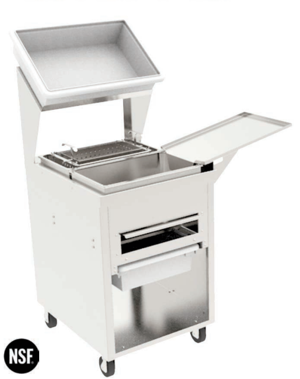
••Some field assembly is required •• [tool provided]