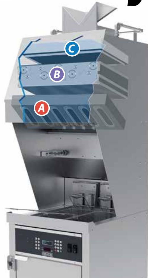
The Giles Ventless Fryer gives you a single, compact unit with a three stage cleaning system integrally bundled with an efficient fryer.